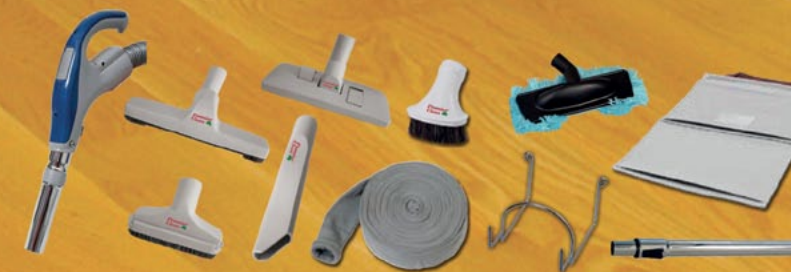
Deluxe Switch Hose Kit

MANUFACTURED BY PREMIER CLEAN PTY LTD www.premierclean.com.au International customers please call ~ 61 3 9357 0942