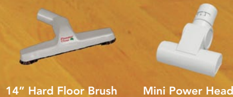
14" Hard Floor Brush Mini Power Head

Premier Clean tool kits use the exclusive De-Lago brand of floor tools. Designed for performance and quality to give your house the finishing touch.