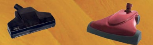
TK270 Power Brush Turbo Cat Power Brush