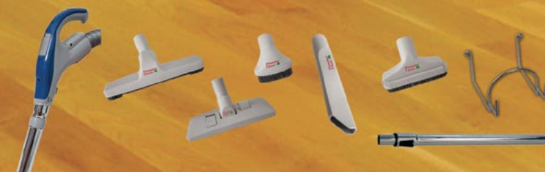
Switch Hose Kit