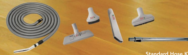
Standard Hose Kit

All Vacuum Hose sets available in 9mt & 12mt lengths